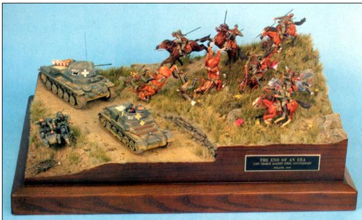
ABOVE: 1/35 scale model by Douglas Lee, titled " End of an Era " depicting Polish Lancers gallantly charging a German tank column.

Full write up here: http://www.militarymodelling.com/news/article/end-of-an-era/3561/#