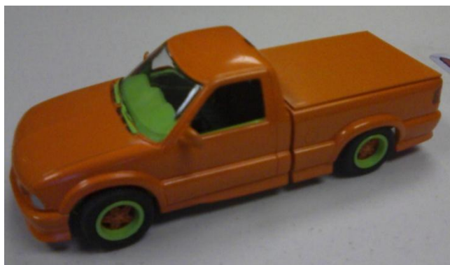
Rusty's airbrushed custom models!